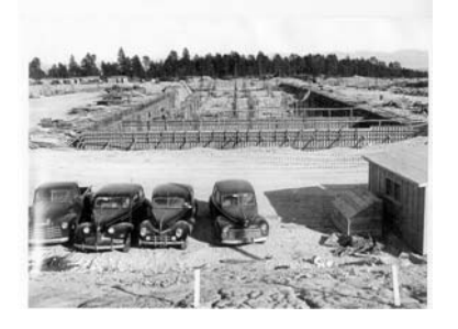
CMR Construction, Circa 1949